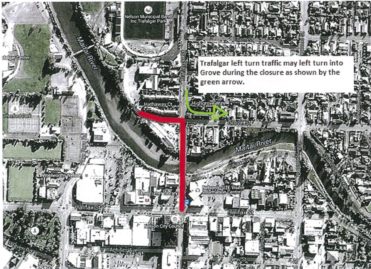
Figure 1—Closure of Trafalgar Street and Hathaway Car Park for the Crusaders vs Hurricanes Super 15 Rugby Match