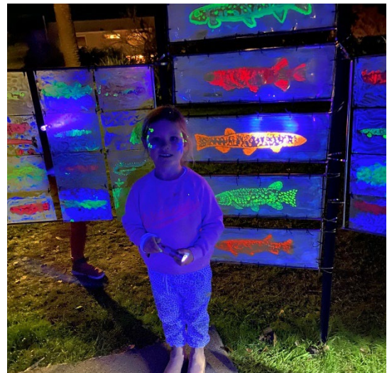
Project Mahitahi featured in Te Ramaroa, Nelson Light Festival 2023