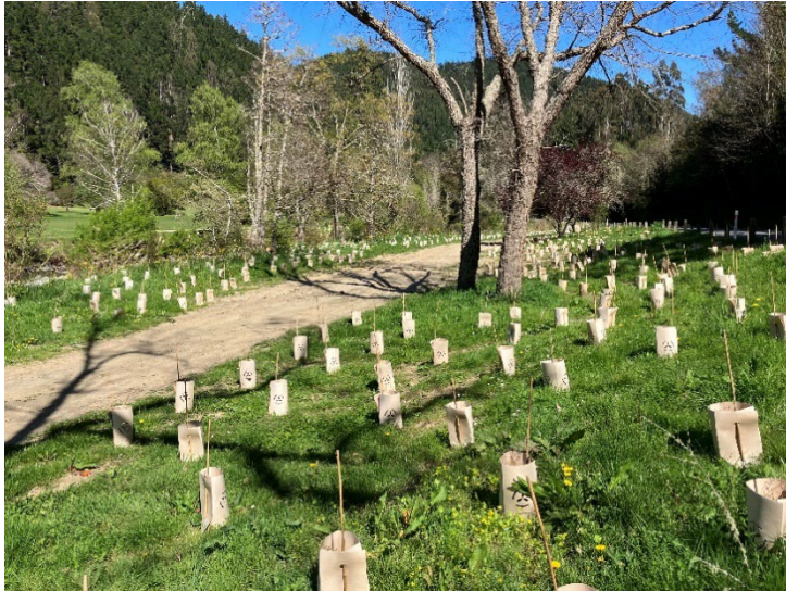
Manatu Reserve (planted 2023)

You are welcome to visit some of the new plantings, such as at the Mahitahi Wetland, where Friends of the Maitai also have flourishing plantings they look after, as well as last year's plantings at the Kahikatea and Manatu Reserves, either side of the Sharlands Creek confluence, and the Global Forest area, planted by FuturEcology with help from Nelson Tasman Multicultural. Many of the trees planted in 2023 were kindly funded by Te Uru Rākau | NZ Forest Service, as part of their One Billion Trees programme, and Trees That Count.