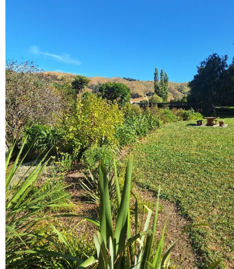
Sunday Hole Riparian Planting