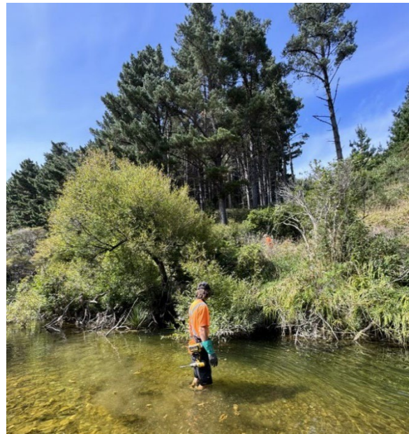
Kūmānu controlling Crack Willow along the Maitai

More than 15,000 trees were planted last winter in areas where Crack Willow had been removed.