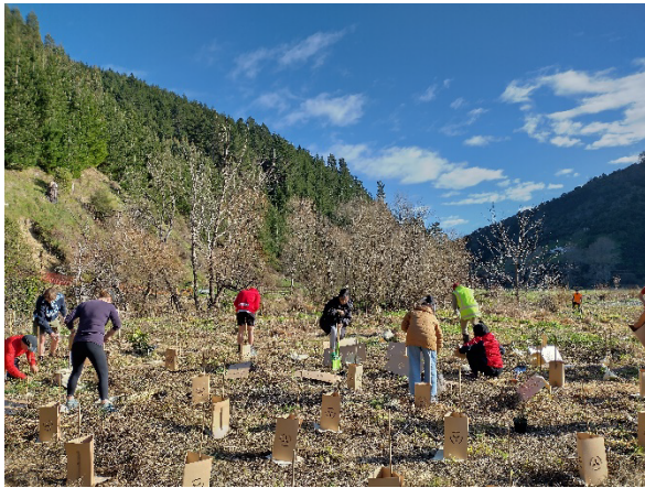
2023 Community Planting with FuturEcology and Nelson Tasman Multicultural

If you have any questions about the Project, or know of others who may wish to join our mailing list, please visit our website or contact: project.mahitahi@ncc.govt.nz