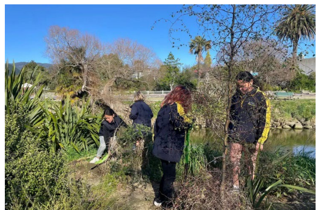
Planting at Shakespeare Walk